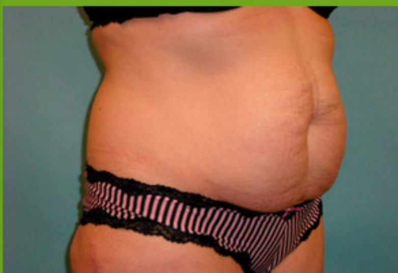
Before Full Abdominoplasty.