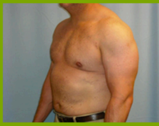
After Vaser Gynecomastia Reduction.