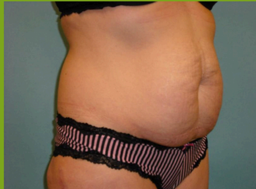
Before Full Abdominoplasty.

Skin, fat and a lax abdominal wall all occur with child-bearing. The most definitive procedure to restore your original abdomen is to perform a tummy tuck with a Vaser liposuction to the flank area if fat exists in the lower back. Come see us for more information!