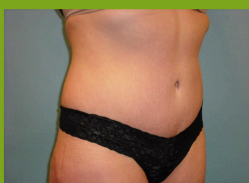
After Full Abdominoplasty.