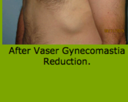
After Vaser Gynecomastia Reduction.