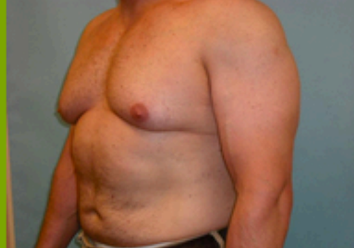
Before Vaser Gynecomastia Reduction.

Call for an appointment NOW at 480-661-6197!